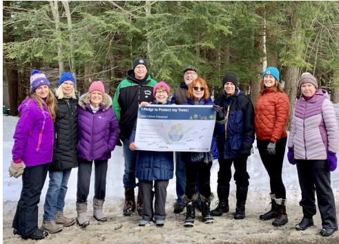
Hemlock Woolly Adelgid Hunters HWA survey training at Craneridge with PRISM on Jan. 28, 2023