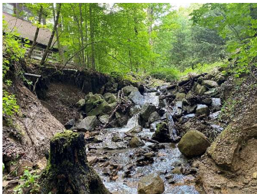
Crump Brook Below Deer Run Culvert; 103 Tarn's backyard

One of the wonderful benefits of living in Craneridge is having Crump Brook and its tributaries wind their way through our neighborhood. We are extremely lucky to be located in valuable and clean Buffalo/Niagara River headwaters.