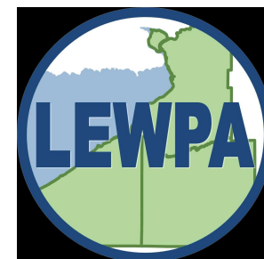
Lake Erie Watershed Protection Alliance