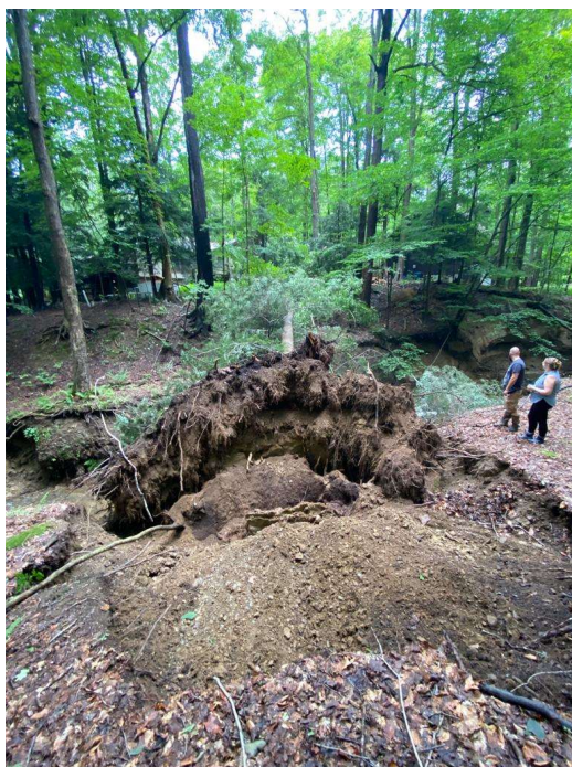
Landslide into Crump Brook behind 104 Tarn

In 2021, what had long been a concern turned into a more critical issue after an intense rainstorm in July. Our eroding streams have prompted us to move from concern to action . A section of a Crump Brook tributary near 103 and 104 Tarn Trail eroded severely to the point of risking property.